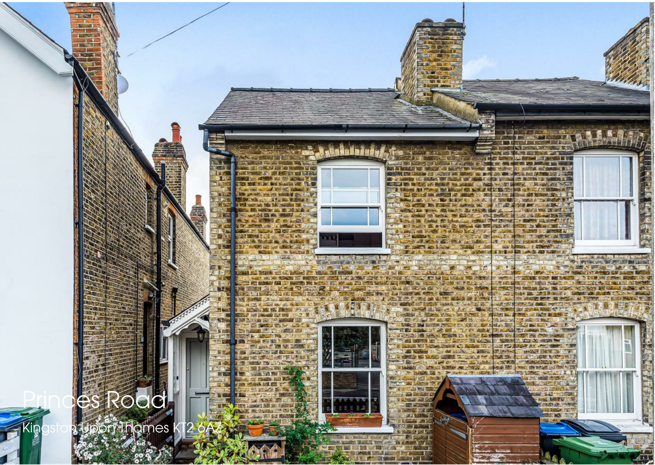
Princes Road Kingston Upon Thames KT2 6AZ

34 Richmond Road Kingston upon Thames Surrey KT2 5ED www.gibsonlane.co.uk Tel: 020 8546 5444